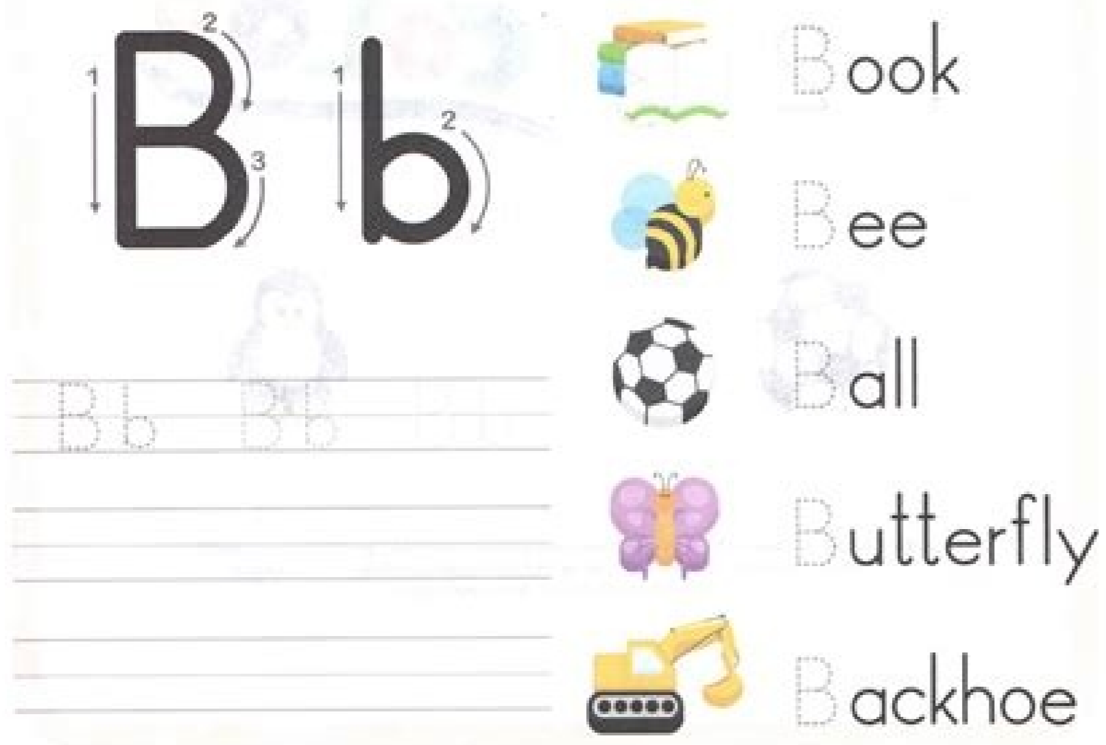
Small capital worksheet. Small and capital letters worksheet. Capital letters small letters worksheet.